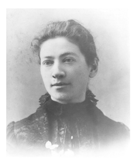
Lulu Younkin San Diego Public Library

Janitor-librarian Hooker was authorized to "let out books" beginning in June 1883 but the circulation rules were strict. Borrowers were required to "furnish good security for their return," or leave a deposit for the full price of the book. The rules were later clarified to specify that "all property owners" could check out books by applying for a library card. All other borrowers needed their library card applications co-signed by a city resident, presumably a property owner.