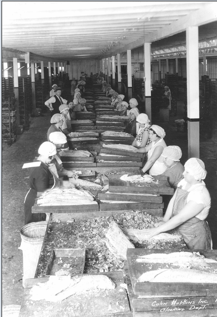
Cleaning tuna fish at the Cohn-Hopkins Company at the foot of Crosby Street in 1931.

Predictions of a “sunset industry” returned in 1980s. Renewed foreign competition and rising costs forced cannery operations to go abroad. In June 1982, Bumble Bee Seafoods closed its plant at the foot of Crosby Street, where San Diego women had canned tuna for 70 years. The Van Kamp Sea Food cannery—San Diego’s last tuna cannery--followed two years later.