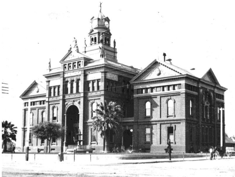
San Diego County courthouse

The Union praised the costly case as "one of the most stubbornly fought trials in the annals of San Diego county." The Los Angeles Times was less respectful; "EXPENSIVE COW FOR COUNTY" mocked their headline.