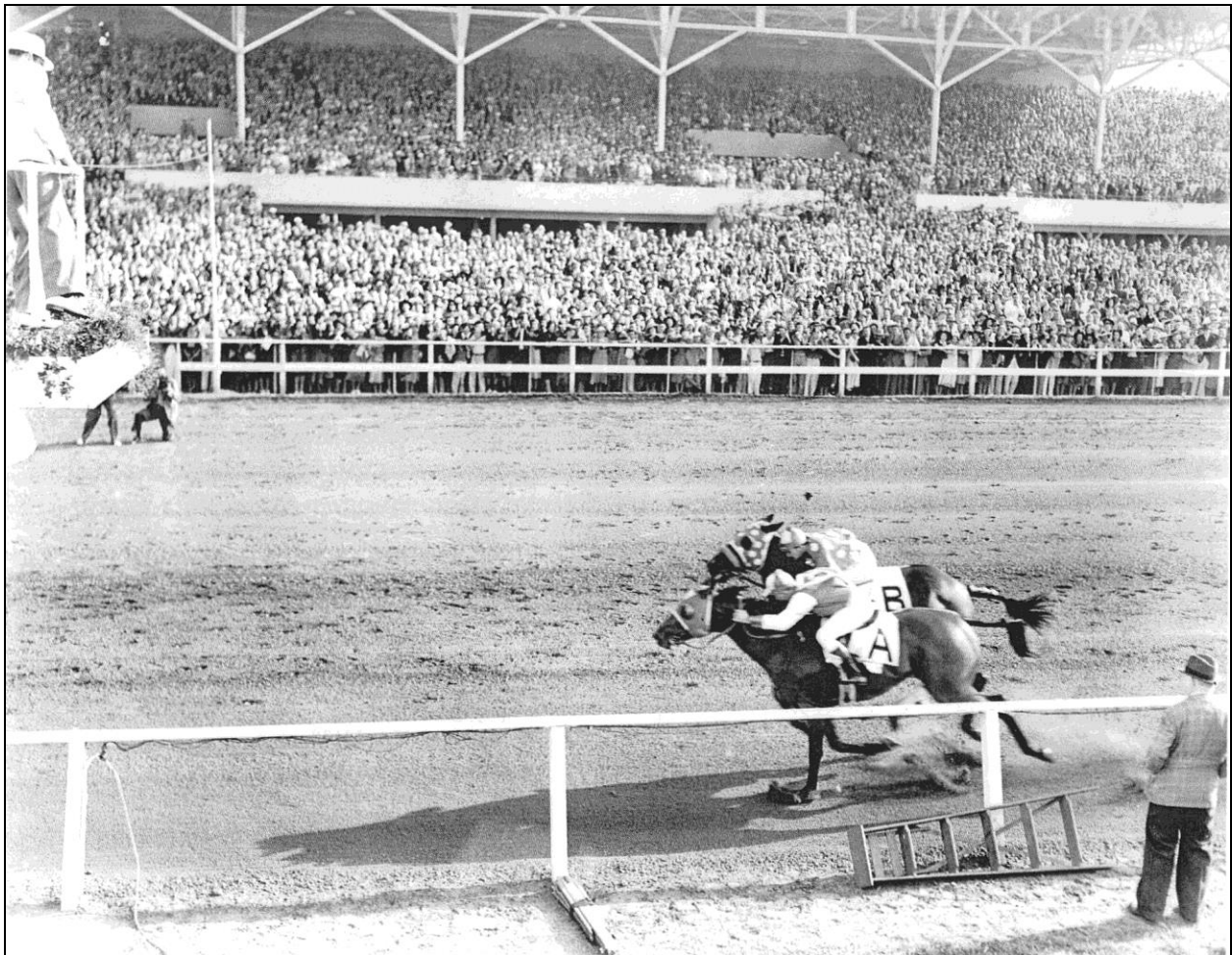
Before 20,000 screaming fans, Seabiscuit leads Ligaroti by a head as they approach the finish.