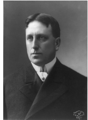
William Randolph Hearst